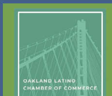
OAKLAND LATINO CoC